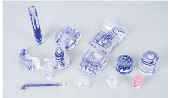
· Transparent resin parts